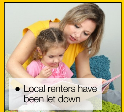
• Local renters have been let down

It's a shame that our Tory MP chose to put his party ahead of the thousands of private renters he's supposed to represent.