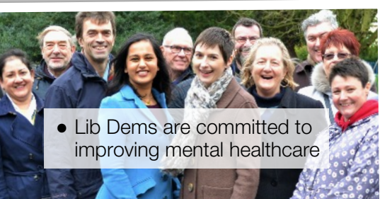
• Lib Dems are committed to improving mental healthcare

Without the Lib Dems to stop them the Tories have taken their eye off, the ball and are neglecting mental healthcare.