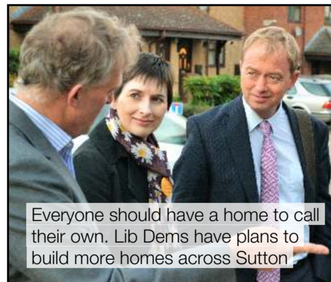
Everyone should have a home to call their own. Lib Dems have plans to build more homes across Sutton

We're also working to bring empty homes back into use, so they don't go to waste.