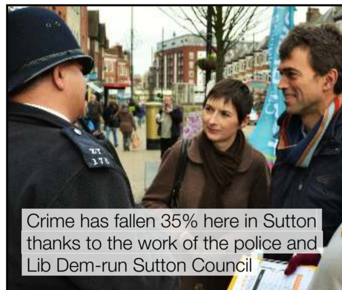
Crime has fallen 35% here in Sutton thanks to the work of the police and Lib Dem-run Sutton Council

Since it was formed crime has fallen 35% and a recent survey found that more and more residents feel safe walking around their neighbourhood.