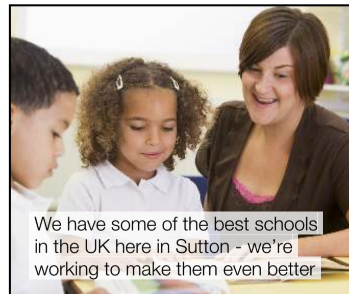
We have some of the best schools in the UK here in Sutton - we're working to make them even better

We are also developing plans for a new secondary school connected to a world-class life sciences hub and one of the best cancer hospitals in the UK.