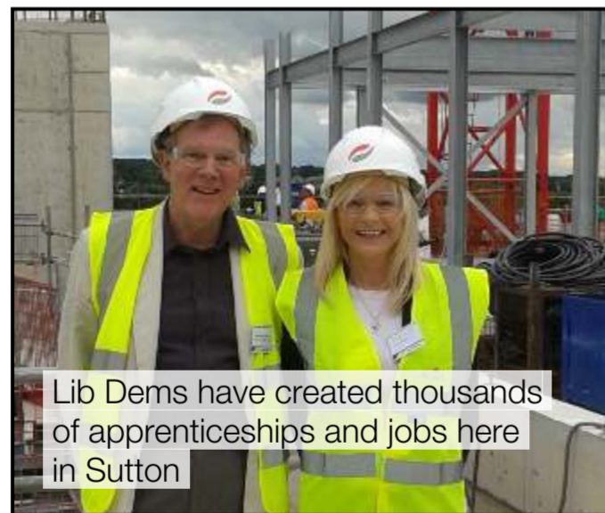
Lib Dems have created thousands of apprenticeships and jobs here in Sutton

Lib Dems have created thousands of new apprenticeships and jobs - and we're working to create even more.