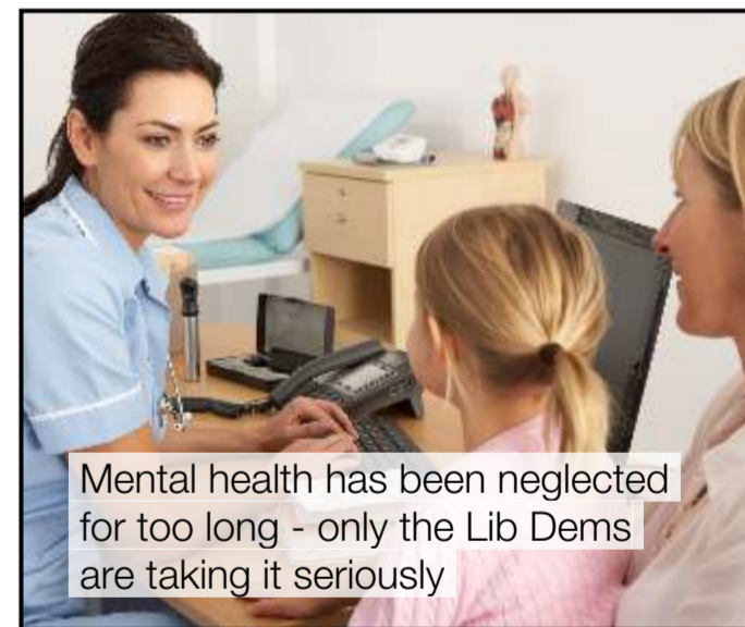
Mental health has been neglected for too long - only the Lib Dems are taking it seriously

And we're taking mental healthcare seriously with more investment and access to talking therapies and counsellors.