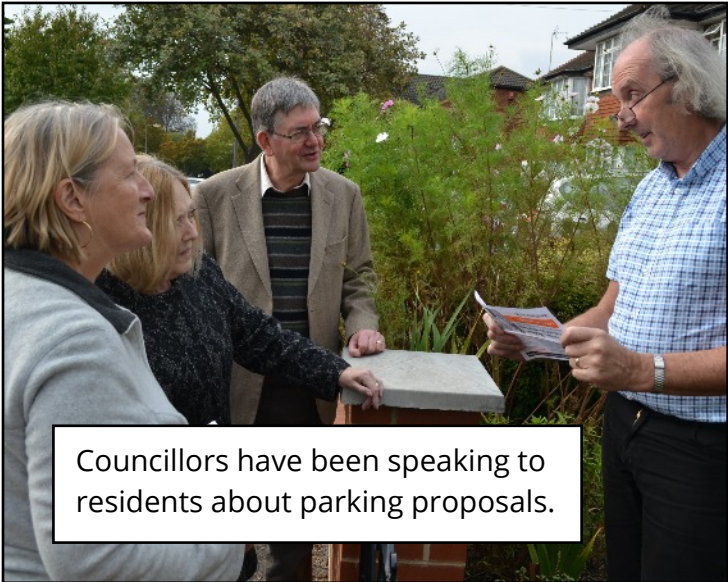
Councillors have been speaking to residents about parking proposals.

The response to the Council consultation has not been as high as we hoped but our discussions with you on the doorstep, and from your feedback to our leaflets, have enabled us to get a clearer idea of what residents want.