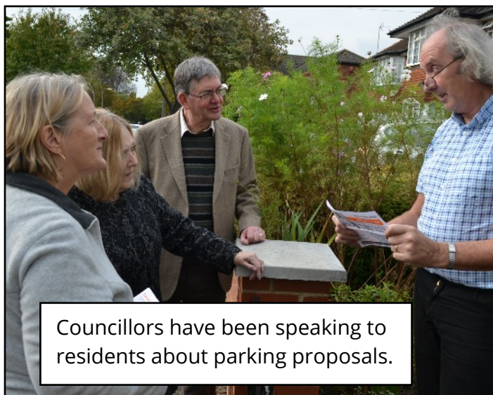
Councillors have been speaking to residents about parking proposals.

It is unfortunate that residents living outside the ward circulated leaflets suggesting that the Council will be imposing Controlled Parking Zones across the whole area – this is not true and has never been proposed. Our proposals after speaking to residents are: