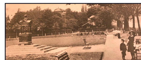
▶ The Edward VII coronation fountain on Sutton Green in 1910

Are you related to any of the Victorian farming families? The